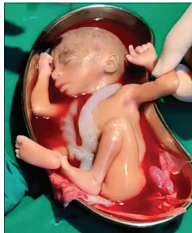
Figure 3: Abortus after expulsion through scar

Uterine rupture was defined as the occurrence of clinical symptoms (abdominal pain, abnormal fetal heart rate pattern, acute loss of contractions, and vaginal blood loss) leading to an