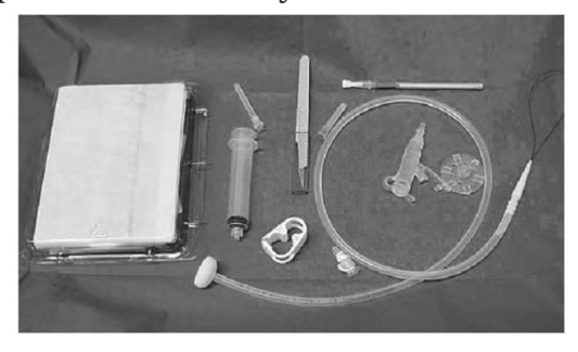
Bombay Hospital Journal, Vol. 61, No. 3, 2019

The PEG procedure is technically simple and accessible to any endoscopist, providing quick, inexpensive enteral access with few complications. The decision to place probes for artificial feeding, especially in the final stages of life, must be based on the expectations of the progression of the disease, the chances of obtaining benefits and the desires of the patient and his family